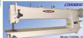
Long Arm Machines