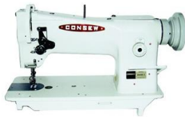
Walking Foot Machine