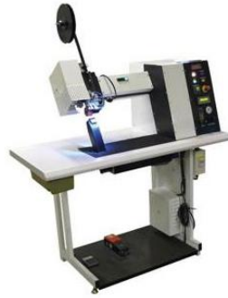
Hot Air Seam Sealers